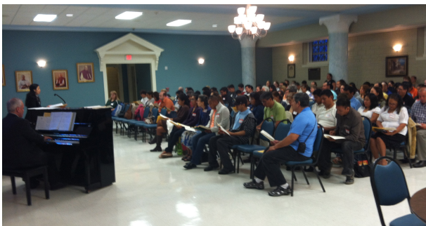
Workshop participants gather at the Cathedral of St. Thomas More in Arlington for the workshop

Thanks to all who conceived of this workshop, and helped to make it happen!